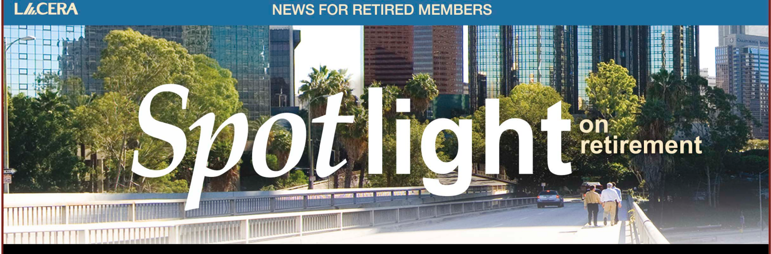
LOS ANGELES COUNTY EMPLOYEES RETIREMENT ASSOCIATION · SEPTEMBER 2022 · VOL. 33, NO. 3