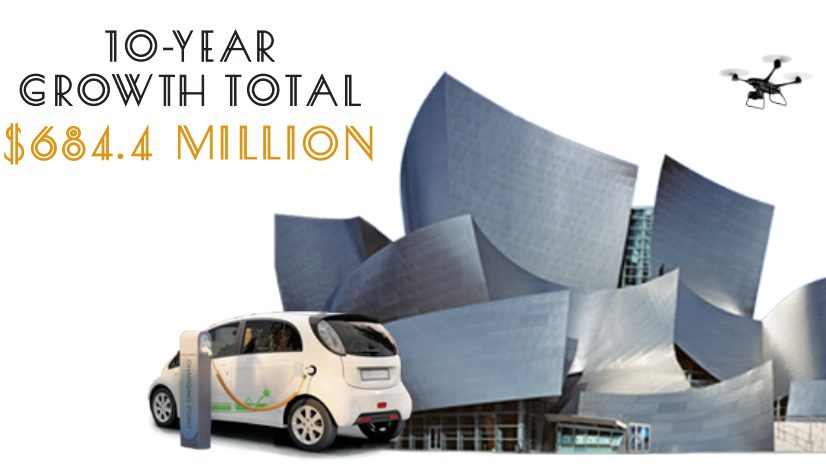
Modern styles emphasize innovative materials, organic forms, sustainability, and adaptable construction for evolving needs and purposes over time.